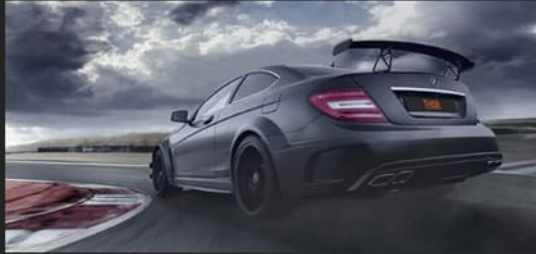
MERCEDES BENZ C63

A team of programmers, engineers, mechanics and sound engineers updates THOR database each month. All sounds are recorded using legendary "live" engines. The main focus of THOR team`s work is an ultimately accurate and realistic imitation of the way each exhaust system sounds.