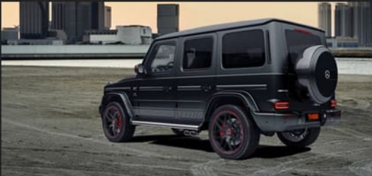
MERCEDES BENZ G63