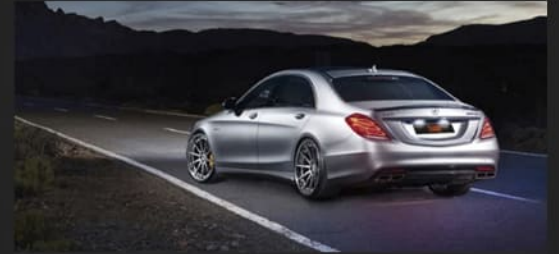
MERCEDES AMG S63