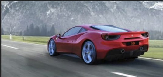
FERRARI 488 GTB